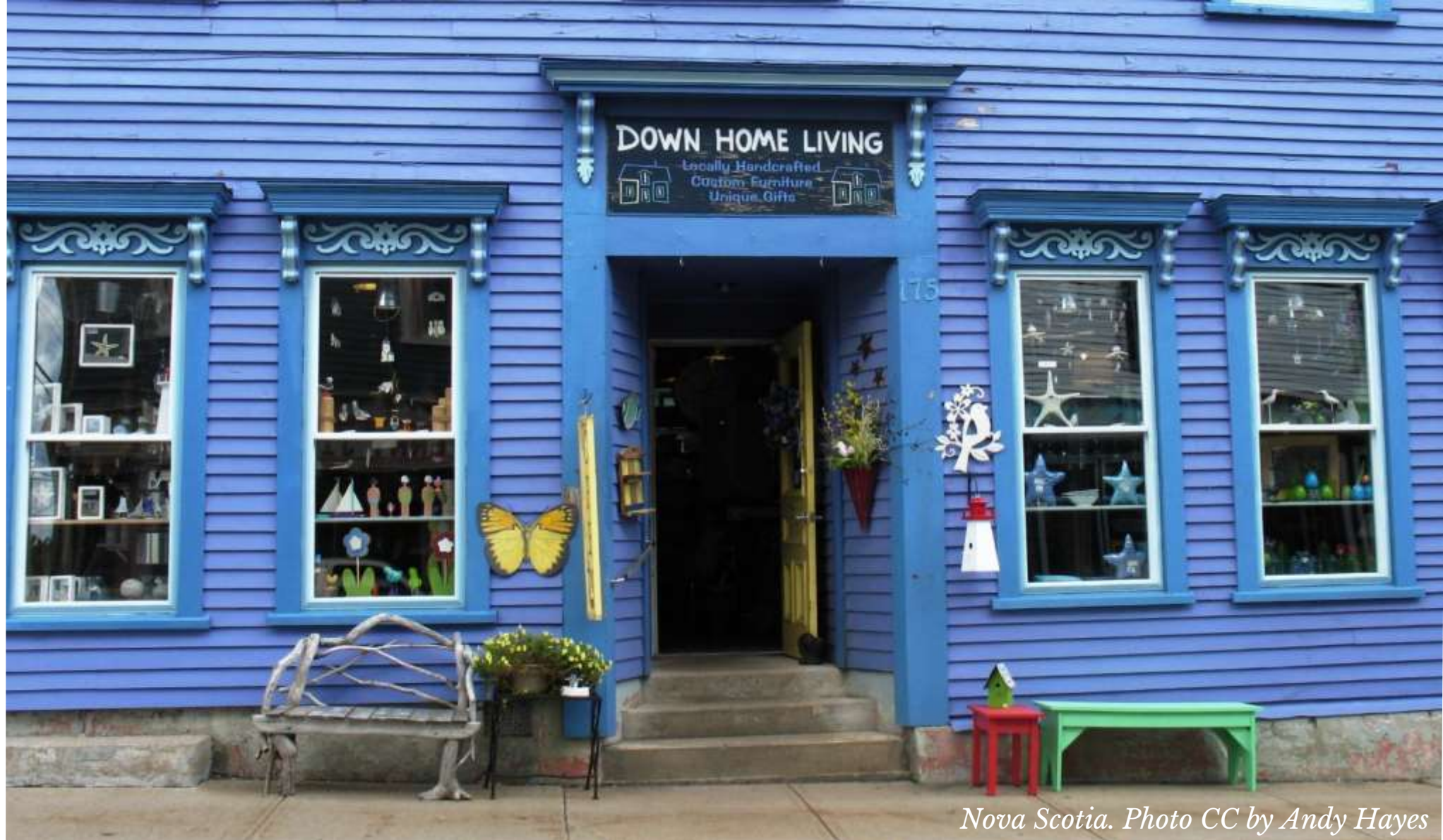
Nova Scotia.